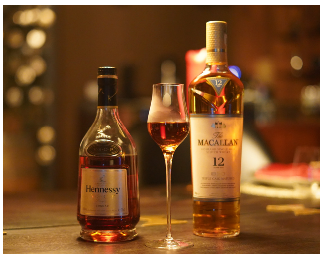
Top Sprit Selection