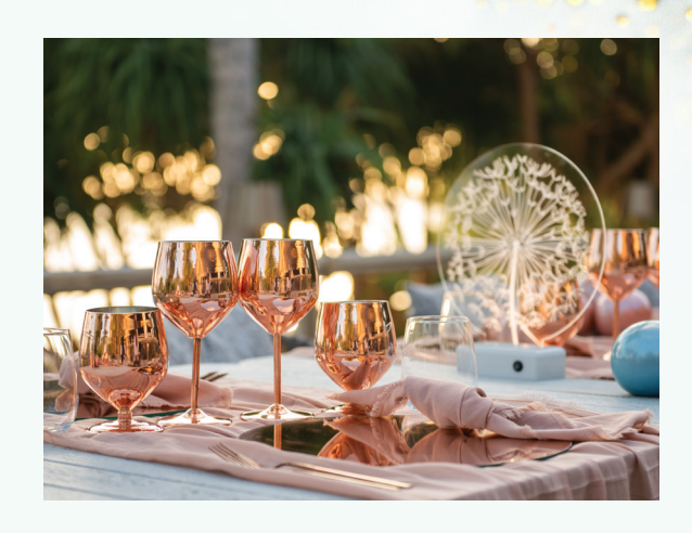
Soulful Seas: Orthodox Christmas Eve Dinner

Begin 2025 on a delicious note. Catering to early birds and late risers alike, our extended New Year's Day breakfast sets the tone for a year of joy and togetherness.