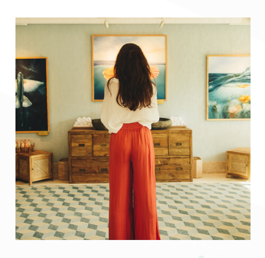
Early Riser: yoga & Meditative Art

Greet the day with an energy-awakening yoga routine, followed by a mindful art session. Engage your imagination and express yourself on canvas.