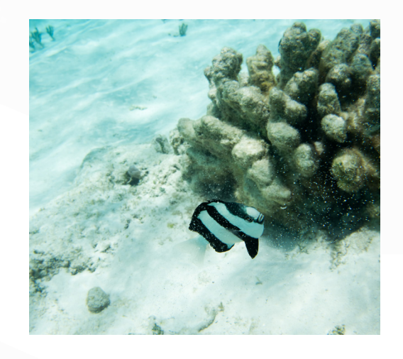
Marine Mysteries: Inorkelling & Sandbank Safari

Greet the day with an energy-awakening yoga routine, followed by a mindful art session. Engage your imagination and express yourself on canvas.